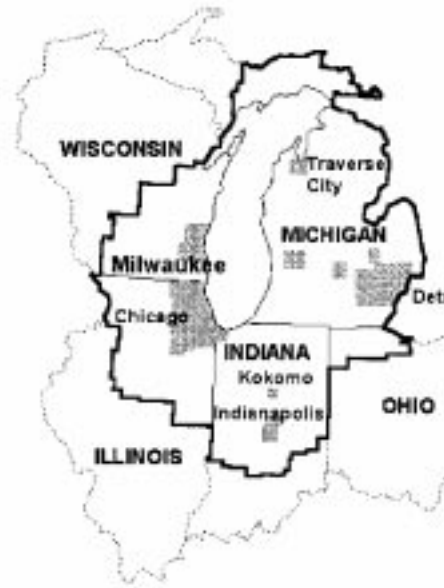
Route guidance availability

1999 by NavTech Route guidance available areas Route guidance available for main roads only