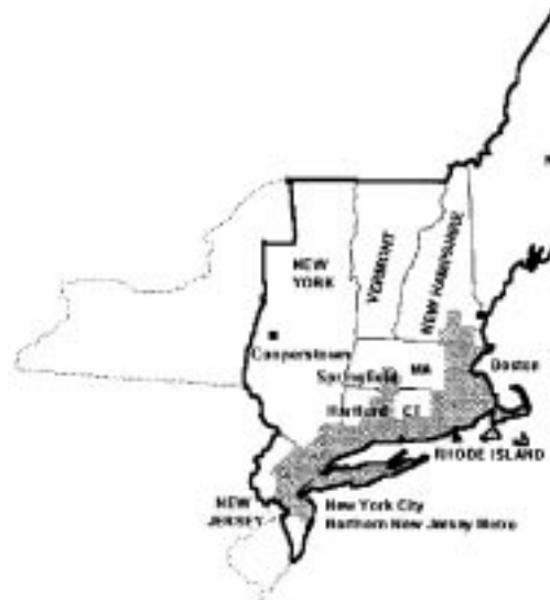
Route guidance availability

1999 by NavTech [Shaded Box] Route guidance available areas [Unshaded Box] Route guidance available for main roads only