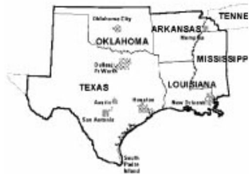
Route guidance availability

1999 by NavTech Route guidance available areas Route guidance available for main roads only