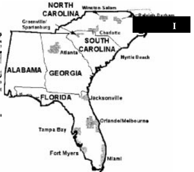
Route guidance availability

1999 by NavTech [Shaded Box] Route guidance available areas [Unshaded Box] Route guidance available for main roads only