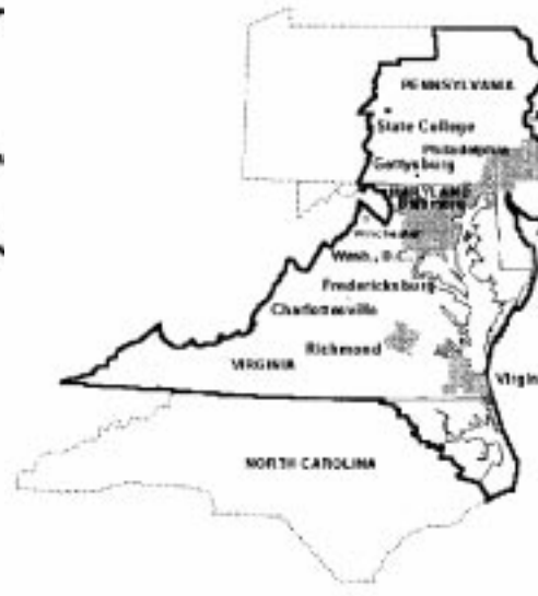
Route guidance availability

1999 by NavTech [Shaded Box] Route guidance available areas [Unshaded Box] Route guidance available for main roads only